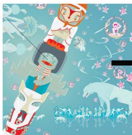
FROZEN ON THE TUNDRA OF FEAR & FOLLY 2014 Archival UV Ink on Photographic Paper 80 X 80CM