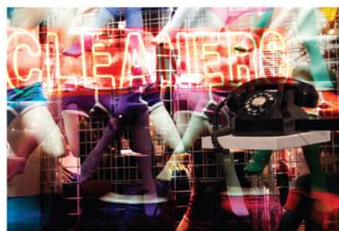
LOOK AWAY, DON'T FOLLOW ME 2012 Archival Pigment Ink Print 50.8 X 76.2 CM