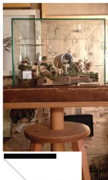
RETURN KUNI 2014 Mixed Media 27 X 27 X 23 CM