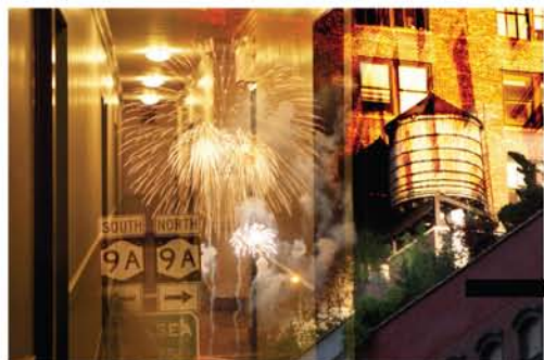
STOP BY ON YOUR WAY OUT 2012 Archival Pigment Ink Print 50.8 X 76.2 CM