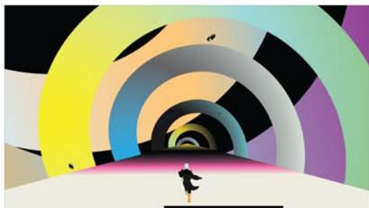
OURBORBOROUS 2014 HD Video

hues & not-so-anodyne characters reveal the curious fantastical world that is the artist's mind.