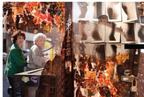
YOU KNOW YOU CAN'T FIT MUCH MORE THAN A BED, RIGHT? 2012 Archival Pigment Ink Print 50.8 X 76.2 CM

At some point, healthy self-reflection may have made us wonder if societal expectations are imposed upon us by others or by ourselves. The struggles with different expectations are universal, though different societies live by different rules & expect differently. & while we do not need to live by societal expectations, adaptation & conforming facilitates assimilation. The layers of readings & misreading in ren zi's work are intentional, encouraged & celebrated; while Jeannie's work brings forth different perspectives of a normally diverse everyday & questions the notion of one's potential when left uninhibited. ren zi's work invites a surrender to the sensorial overload of colours, activity & myths – & for logic to yield to emotion; even as Jeannie's work encourages a leisurely appreciation of multi-layered vernaculars that over time gain in significance & meaning.