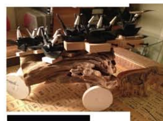
RETURN SENBAZURU 01 2014 Mixed Media 27 X 27 X 23 CM