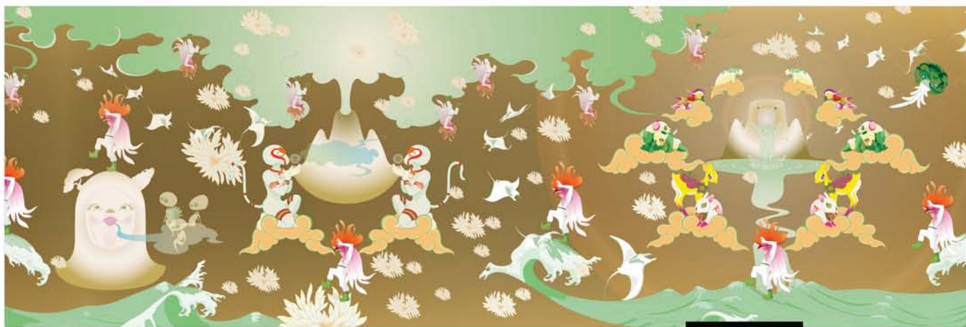
AWESTRUCK WITHIN LIFE'S CONCATENATED HELICES 2014 Archival UV Ink on Dichroic Film & Acrylic 240 X 80 CM

ren zi's work is simultaneously an explosion & amalgamation of tales, real & fabricated. Bursting forth from an intense desire to express as much as possible in any given frame, he compresses time & synthesises his influences & imaginings in a wonderland of psychic landscapes (which the artists have collectively dubbed psy-scapes). This peek into his inner world of saccharine