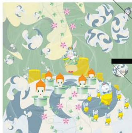
TRUNCATED HYPERSPACE OF THE MAGUS TWISTED UPON ITSELF 2012 Archival UV Ink on Photographic Paper & Acrylic 80 X 80 CM

The thrill ride of the amusement park that is his idiosyncratic universe is the short film "ouroborous". His version of Alice's trip down the rabbit hole is a fractured memoir that does not seek to be understood logically but provokes a visceral reaction throughout the ride. As a virtual time warp of the artist's self-mythologised autobiography, you realise by now that it is ultimately needless to cling to time, memories & logic.