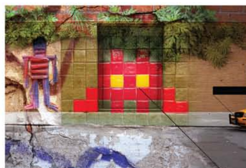
HIGH, LOW, A WALL OF GOLD, YOU SURPRISE ME 2012 Archival Pigment Ink Print 50.8 X 76.2 CM