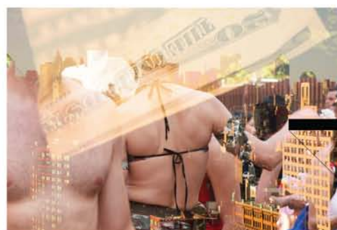
HUNDRED AND FOUR AND A TWENTY 2012 Archival Pigment Ink Print 50.8 X 76.2 CM