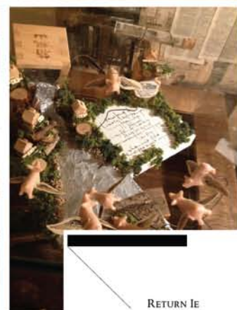
RETURN IE 2014 Mixed Media 27 X 27 X 23 CM