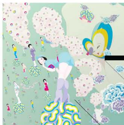
LOST IN THE INFINITE PLAYING FIELD OF EROS 2014 Archival UV Ink on Photographic Paper 80 X 80 CM