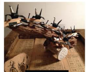
RETURN SENBAZURU 02 2014 Mixed Media 27 X 27 X 23 CM