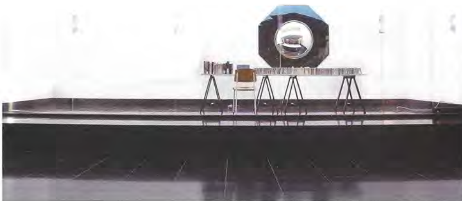
Mnemosyne #4 2015

books, CDs, vintage laptop running iTunes playlist, Ikea furniture, projection, digital print on clear acetate & sticker dimensions variable